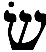
S like soft