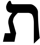
T like today

Instructions: Use Avery® Business Cards #8371 or #5371 or generic brand of same size or use card stock and cut out along the lines on the back.