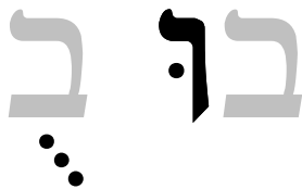
U like tune (VU or VOO)