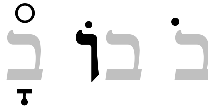
O like go (VO)