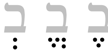
E like red (VEH)