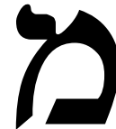
M like mint